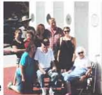
Ed.: sorry pics are so small - no space